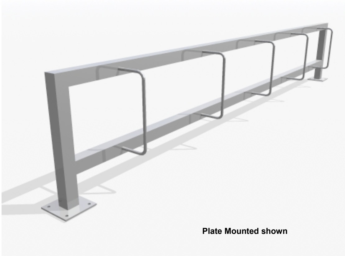
Plate Mounted shown

The Cambridge Motorcycle Rack is made from 80mm steel tube. Available in with hoops every 900mm apart or to suit site requirements. Mild Steel to BS 1449. Hot dipped galvanised to BSEN ISO 1461 (1999). Optional Polyester Powder Coat in any colour.